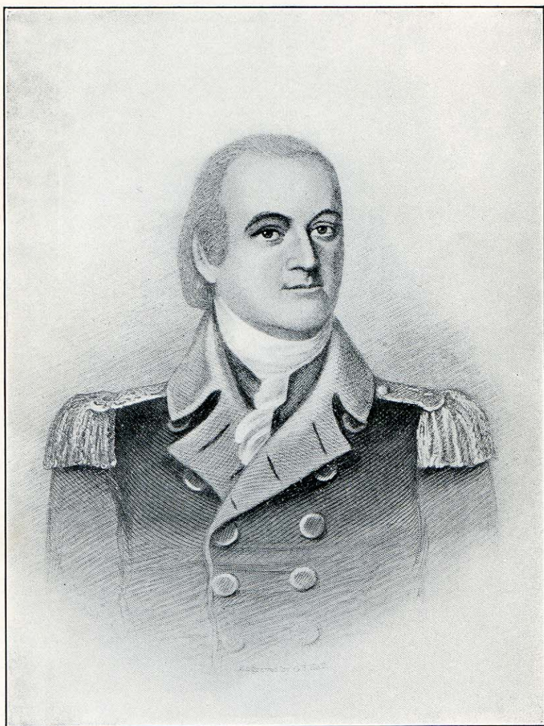
HON. WILLIAM ALEXANDER (MAJOR-GENERAL LORD STIRLING). Organizer, 1754. Trustee, 1754-1756.