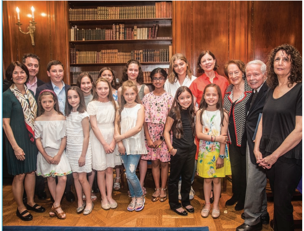
The 2017 Young Writers Awards winners and judges.