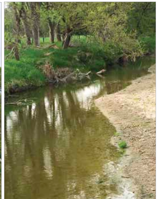
A creek where the Cather children played