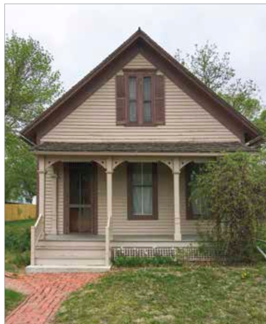
Willa Cather's childhood home

Experiencing Red Cloud, one can understand the love of the land that Cather grew to know, as well as her need to move on to the world beyond. The wide-open Nebraska landscape and the people she knew there inspired her, but in a letter written in January of 1896, her heading states that she is writing from "Siberia (Red Cloud)."