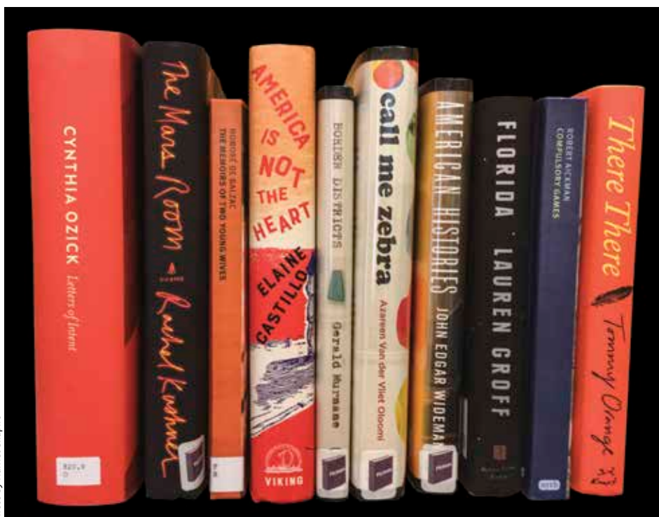
Some books recently purchased with our new book funds.