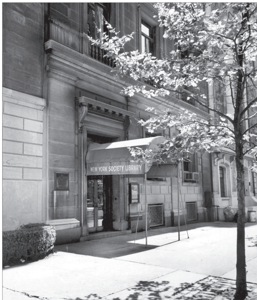
The Library in the 1950s