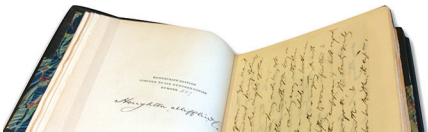
A Meaningful Gift PAGE 10