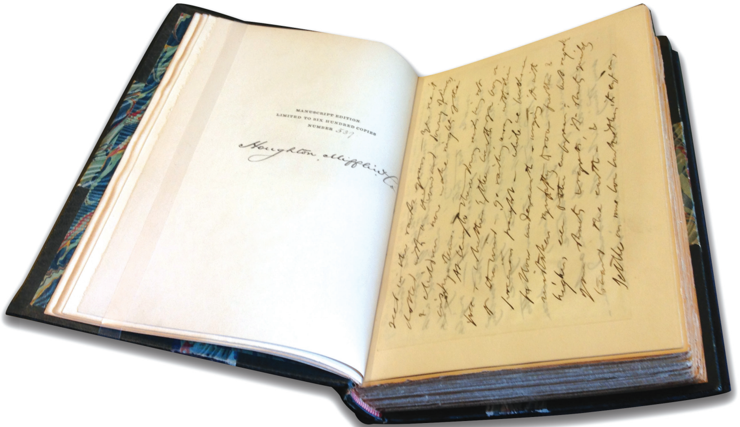
The Thoreau journal fragment in a volume of the collection