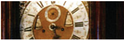
New Hours in 2015 PAGE 2