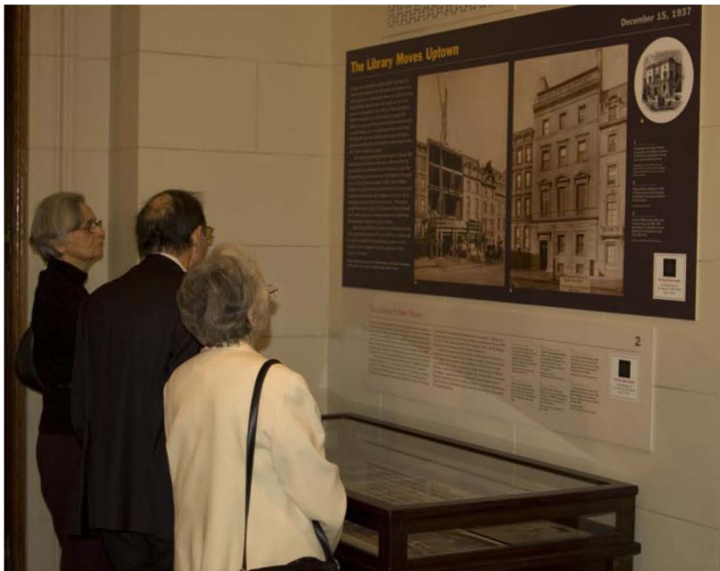
Members enjoying the new exhibition at its opening on December 15