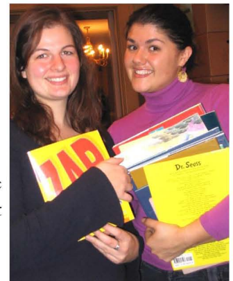
Teachers selecting books at Project Cicero 2007

To join over 90 schools and other organizations in donating books, look for the boxes in the Library's entry hall or call the Project Cicero mailbox at 212-288-6900 x511. More information about the book drive and a wish list of titles is available at www.projectcicero.org .