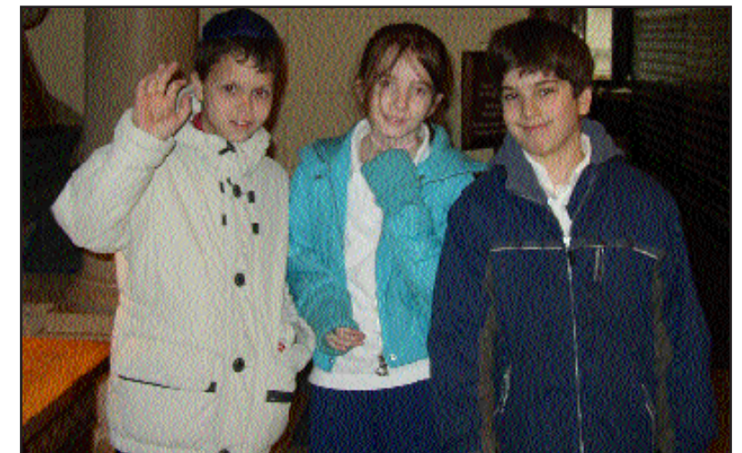
Students from member school Ramaz turn in their competition entires