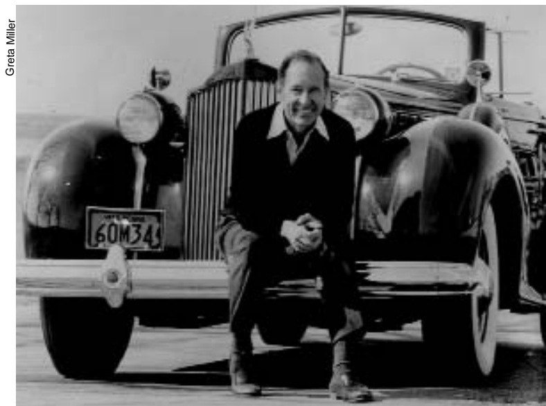
Anton Myrer with the "Empress," the 1938 Packard Super 8 which inspired The Last Convertible .

Born in Worcester, Massachusetts, Myrer grew up in the Berkshires, Cape Cod, and Beacon Hill--all settings for his novels. A 1941 graduate of Boston Latin School, he interrupted his education at Harvard after Pearl Harbor to enlist in the Marine Corps and spent more than three years in the Pacific. He rose to the rank of corporal, took part in the invasion of Guam, and was wounded. He returned to graduate from Harvard magna cum laude and subsequently lived on the Cape, in Portugal, and at the time of his death, in up-state New York where he received books by mail from the Library.