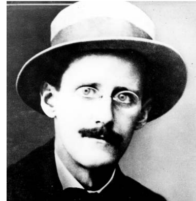
James Joyce in Zurich circa 1917

Among the many joyous rituals of the June calendar, Bloomsday on the 16th of the month is a celebration fast becoming popular beyond the particular circle of James Joyce scholars. In Dublin, literary pilgrims and urban explorers gather to honor Leopold Bloom, the hero of Joyce's epic Ulysses . With text in hand and preferably garbed in oddments of Edwardian style, they trace Bloom's wanderings on that single day in 1904. Though Joyce left Ireland to write in permanent exile, he said that his native city, if ever destroyed, could be reconstructed by reference to his novel. Indeed, most of the landmarks of Joyce's "dear, dirty Dublin" have survived rebellion, civil war, and the wrecking balls of real estate developers.